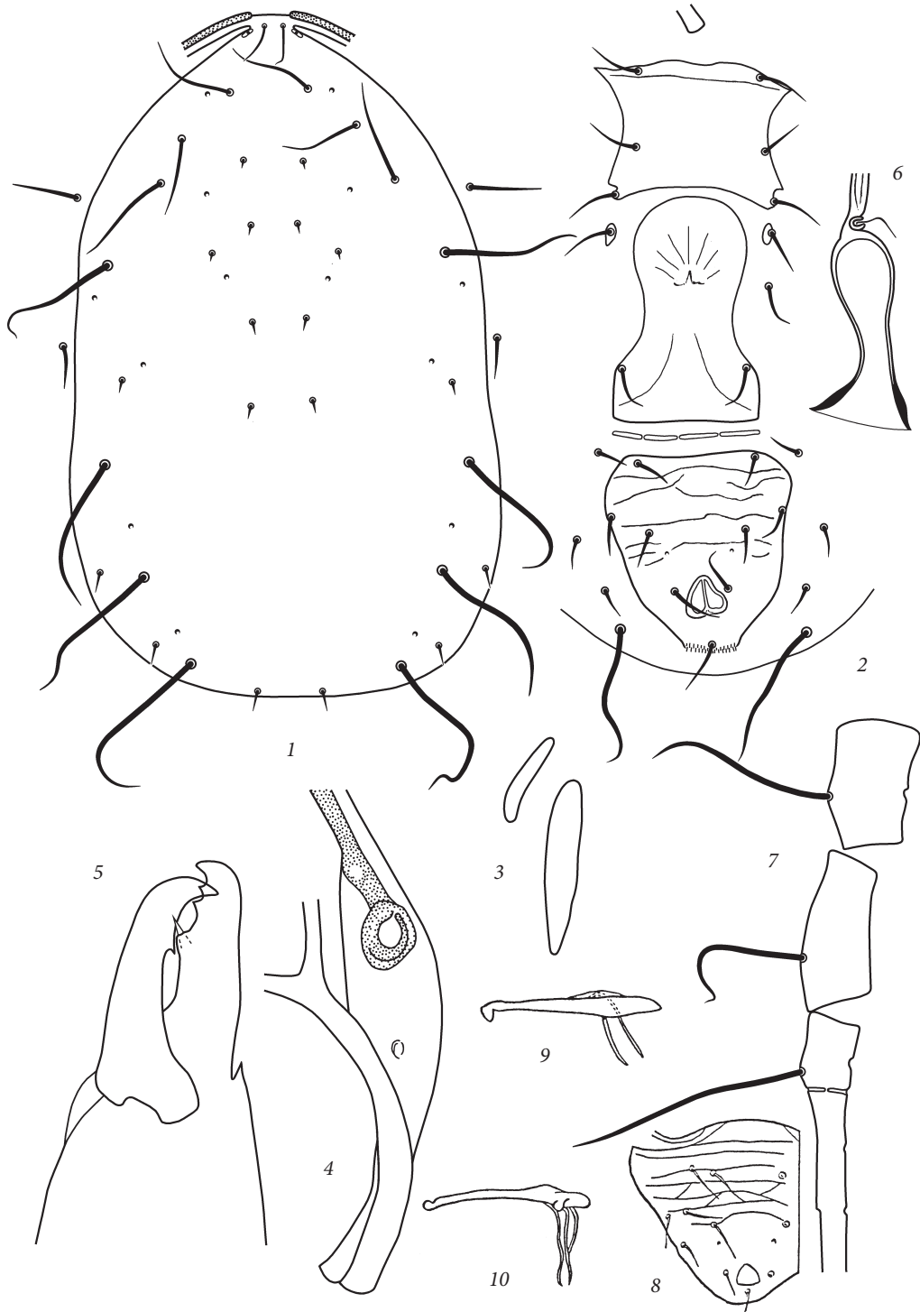
Fig. 2. Graminaseius lituatus (Athias-Henriot) ♀ (1–7), ♂ (8–10 from Athias-Henriot, 1961): 1 — dorsal shield; 2 — ventral body surface; 3 — metapodal plates; 4 — posterior part of peritremal shield; 5 — chelicera; 6 — spermatheca; 7 — fragment of leg IV; 8 — ventrianal shield; 9, 10 — chelicera with spermatodactyl.

to miniature (4–6 \mu\text{m} ), while the thickness of the long setae does not interfere with their flexibility. All setae are smooth. Seta AM1 equal to or somewhat longer than distance to theca AL1. Seta AL1 longer than distance to theca of seta AL3, which in turn reaches theca