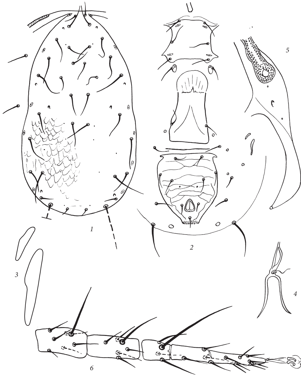
Fig. 4. Graminaseius altimontanus Kolodochka, sp. n., holotype ♀: 1 — dorsal shield; 2 — ventral body surface; 3 — metapodal plates; 4 — spermatheca; 5 — posterior part of peritremal shield; 6 — fragment of leg IV.