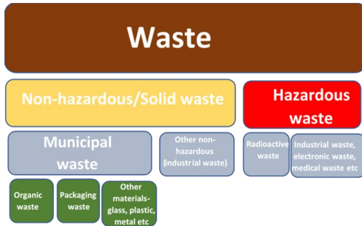
Figure 1. Type of waste source