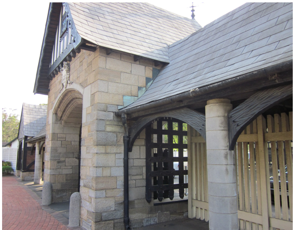
Figure 3. Entrance gate to Clairwood Turf Club ca 1950s, now demolished