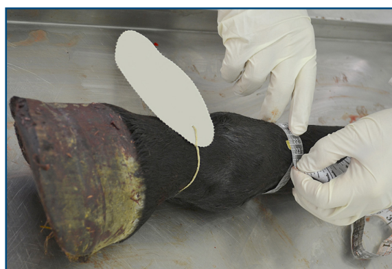
Figure 2. Shin circumference measurement of the isolated limb five hours after death. Sample 1b.