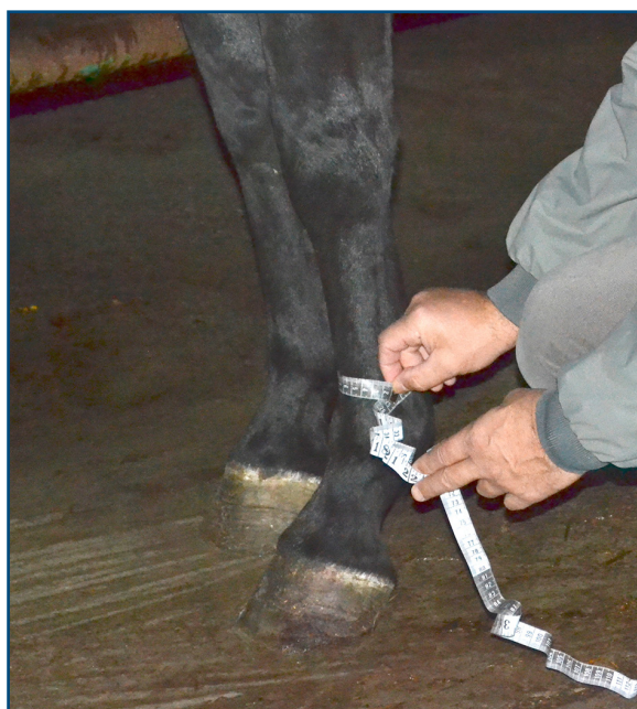
Figure 1. Shin circumference measurement in the living horse. The measurement was performed right above the fetlock joint. Sample 1b.

The aim of this study is to evaluate the conformity between the measurement of the shin circumference in the living animal and in post-mortem examination in order to assess its forensic soundness.