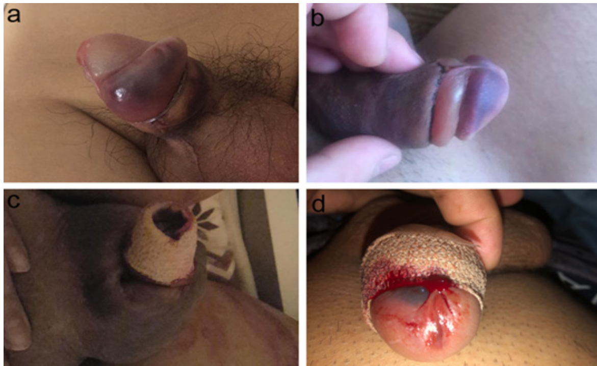
Figure 2. a Representative edema of the modified DCSD. b Representative edema of the conventional DCSD. c A postoperative hematoma case of the conventional DCSD. d A postoperative hemorrhage case of the conventional DCSD.