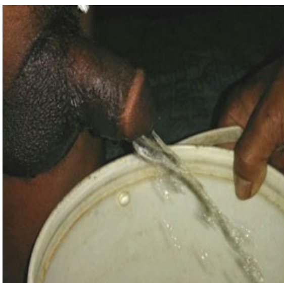
Figure 4. Voiding photo with satisfactory stream at 6 months follow up.

Urethral advancement is considered as a good single-stage technique for distal hypospadias repair, (2) but the main drawback for this technique was meatal stenosis and need for high degree of expertise of the surgeon to dissect the urethra without causing any injury. (3) Various methods used to decrease meatal stenosis are vertical and horizontal slitting of the glans, tunneling of the glans using hair transplant apparatus, and trimming of urethra in an oblique fashion about 1 to 2 mm more