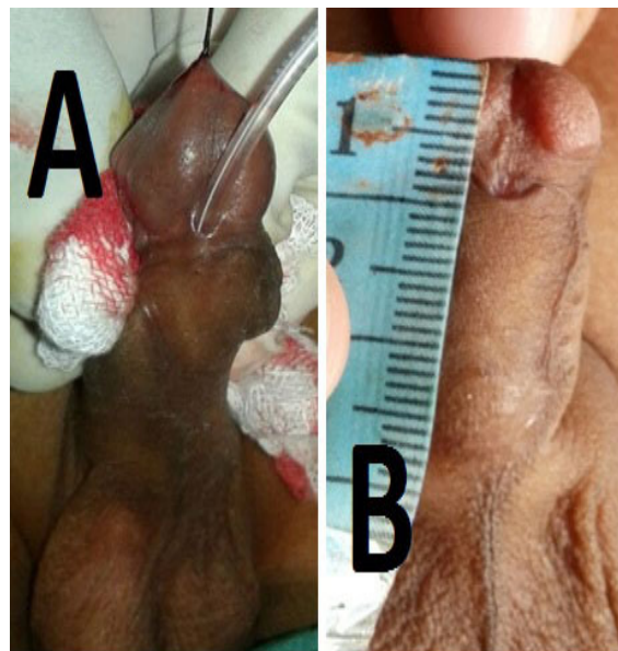
Figure 1. (a): Pre Op image with feeding tube; (b): Measurement of urethral plate.

patients received broad spectrum antibiotics and anti-inflammatory drugs for seven days. Proximal urinary diversion was not used in any of our cases. Feeding tube was removed on 10th postoperative day .