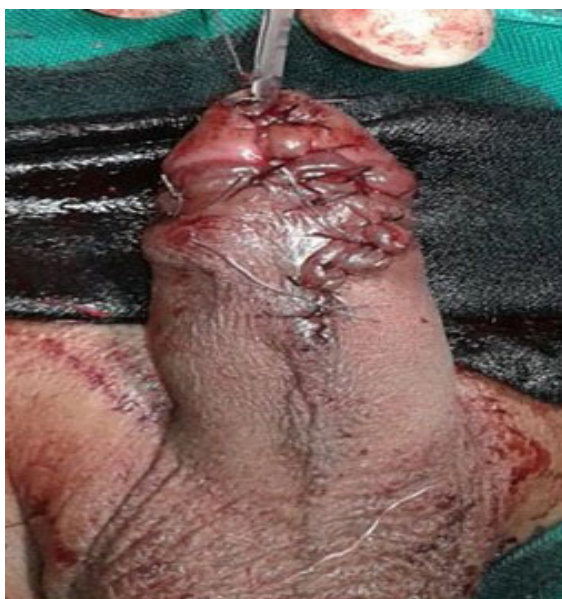
Figure 3. Postoperative image.

to precarious blood supply in Mathieu, meatal regression and stenosis in meatal advancement and glanuloplasty (MAGPI). Results of tubularised incised plate urethroplasty (TIPS) repair depend on various factors like characters of urethral plate, together with an incidence of disruption, fistula and meatal stenosis. (1)