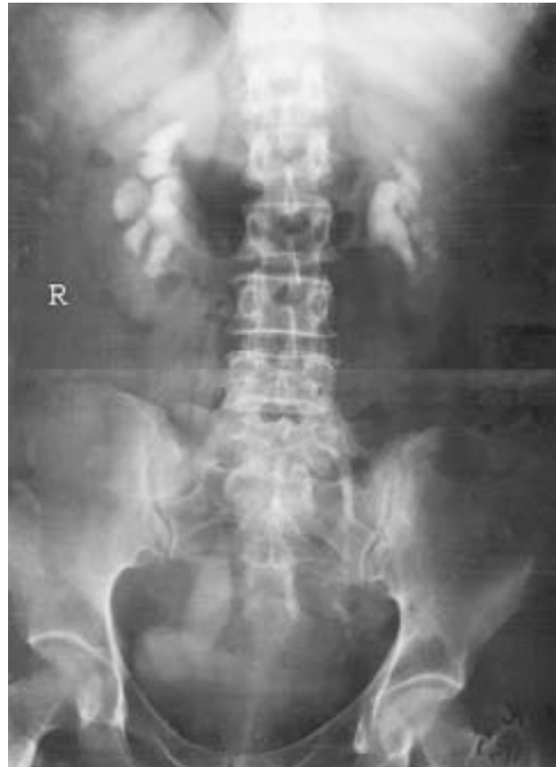
FIG. 3. Intravenous urogram demonstrating left severe hydroureteronephrosis with normal drainage of right system

Endometriosis of the urinary tract is rare, and the bladder is the most common site of involvement. Endometriosis usually occurs between menarche and menopause, because of the fluctuating levels of estrogen and progesterone