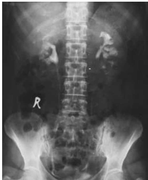
FIG. 4. Follow-up Intravenous urogram showing resolution of left upper tract dilatation after excision of the stricture and ureteroneocystostomy