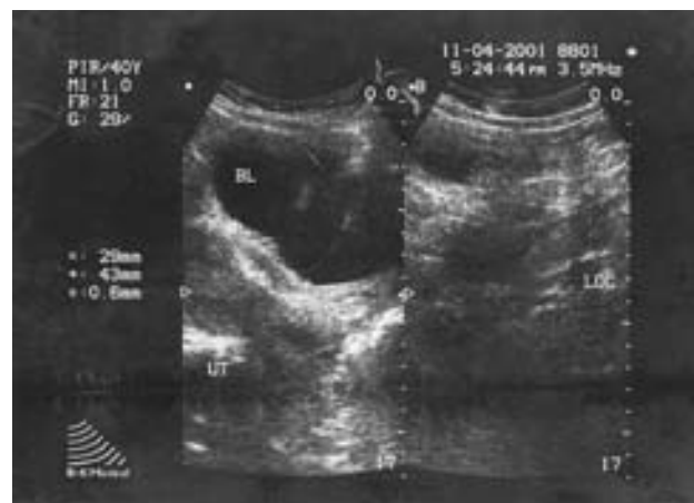
FIG. 1. Premenstrual transabdominal median longitudinal ultrasound scan of pelvis. The bladder has normal appearance.

A 42-year-old woman presented with a 4-year history of dysuria, frequency, and urgency. She experienced exacerbation of dysuria and urinary frequency during her menses. Her past history was significant for 4 cesarean sections, latest of them was done 13 years ago. Several physicians had treated her for urinary tract infection, pelvic inflammatory disease, and cystitis. Serum and urine investigations were unremarkable. Excretory urogram (IVP) showed normal upper and lower urinary tracts. Ultrasonography was normal in non-menstruation days (fig. 1), but it revealed a 31 × 66 × 23 mm mass on the posterior bladder wall during menstruation (fig. 2). On cystoscopy in premenstrual days, a small nodule was seen. Punch biopsy from this lesion showed normal transitional cell epithelium