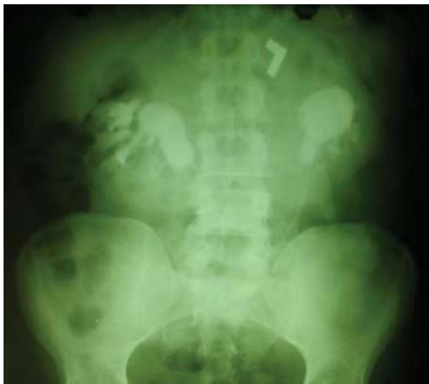
Figure 1. Intravenous urography in a horseshoe kidney with left renal stone.

The recorded variables were patients' age, gender, stone-related factors (side, size on kidney, ureter, and bladder x-ray or computed tomography, stone number and location, access site, and tract number), serum hemoglobin and creatinine level before and after procedure, duration of hospital stay, and complications during and after the operation. Preoperative intravenous urography had been obtained from all the patients (Figure 1), but computed tomography scan had been performed in 10 patients without any retrorenal colon (Figure 2). Percutaneous nephrolithotomy was performed in prone position with a subcostal access to the collecting system. In all the patients, only one tract was created. Access site was based on stone burden, stone location, and collecting system configuration. A 27F rigid nephroscope was