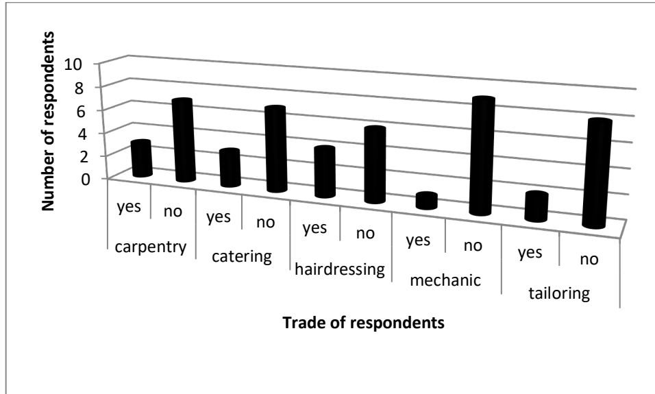
Figure 3: Facilitator's incorporation of environmental education into skill acquisition