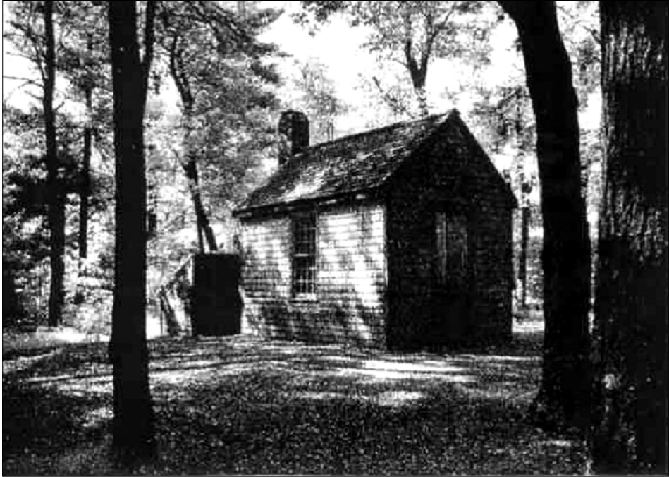
EXAMPLE 7 A reconstruction of Thoreau’s cabin at Walden Pond 104

Wherever the place – time there must be. ... Time from the demands of social conventions. Time from too much labor (for some) which means too much to eat, too much to wear, too much material, too much materialism (for others). Time from the “hurry and waste of life”. ... Time for practicing the art, of living the art of living. 103