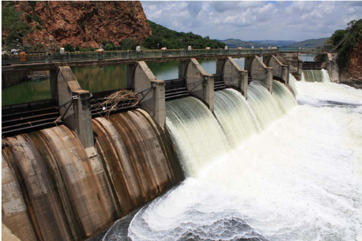
Illustration 4: The Hartbeespoort Dam was originally completed in 1923 and raised through the addition of sluices (pictured) in 1970. 38

It is significant to note that at the majority of these schemes, including the largest (Vaalharts) and second-largest (Loskop) irrigation schemes in the country, manual labour was used almost exclusively. By 1938, expenditure on state water infrastructure had reached ten times the figure of 1928. 39