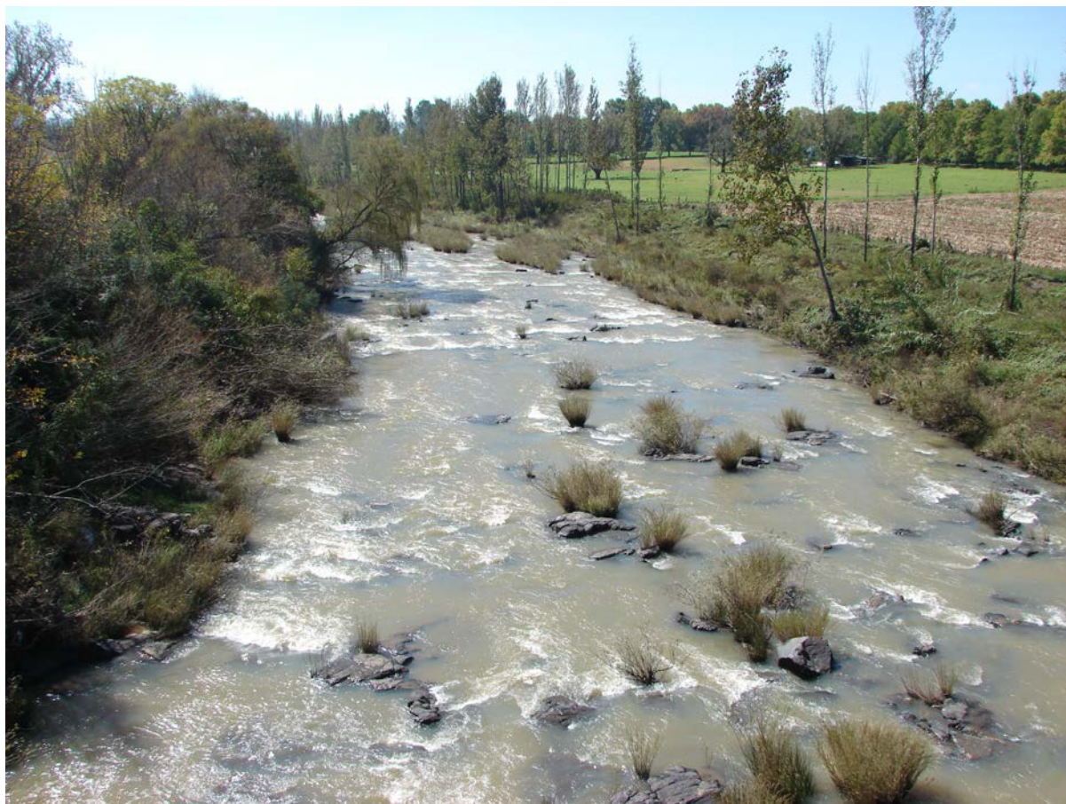
Illustration 12: The Tukhela River in KwaZulu-Natal was one of the first rivers on which hydrobiological studies were undertaken in South Africa under the Natal Rivers Research Fellowship. 82

By 1965, the Natal Rivers Research Fellowship had covered some 46% of Natal and Zululand. 83 A particularly important discovery made through the programme was the fact that communities of aquatic plants and animals were found to be sensitive to alterations in water quantity and quality. This would later become one of the main indicators of river health in South Africa, especially in the DWA River Health Programme, established after 1998.