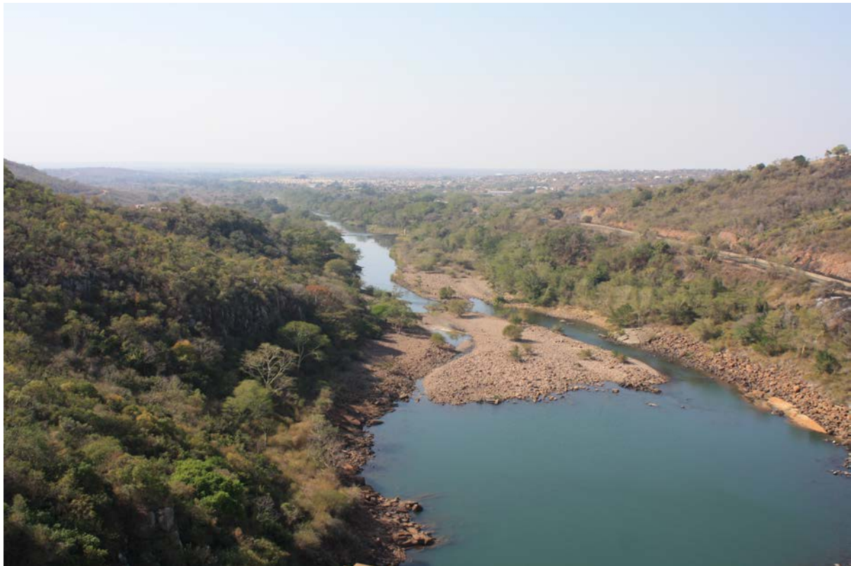
Illustration 13: The Pongola River downstream of the Pongolapoort Dam. 109

In 1967, NPB employee Mike Coke started research on the fish ecology of the floodplain lakes with a view of determining the effect of the dam. 108 Coke's research subsequently underlined the importance of natural flooding to the life history of the fish species supported by the floodplain.