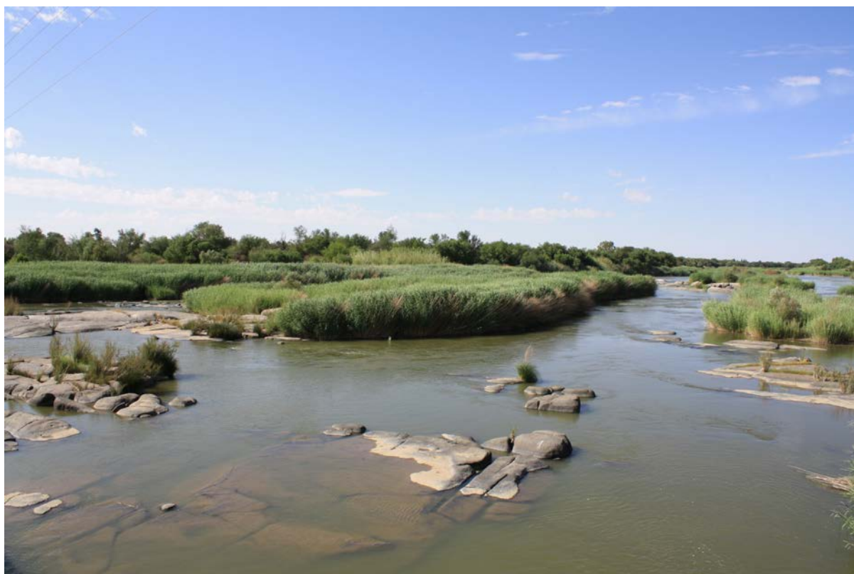
Illustration 2: The Orange River is South Africa's largest river, carrying 22% of the country's total river flow. 20

The first recorded modern dam was built in 1660 to supply water to Dutch trade ships travelling to and from the West Indies and held around 2 000 m 3 of water. 21 As European settlers began to trek further inland over the next century the frontier expanded ever northwards and eastwards. Settlement was mostly concentrated around groundwater springs and a few perennial rivers. 22 Springs were later dammed to provide water for livestock while furrows were led from streams to irrigate household gardens and small plots. 23