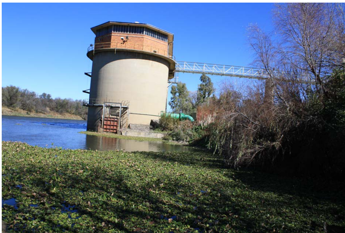
Illustration 5: Hyacinth in the Vaal River at the Midvaal Water intake in 2009. 72

Members of the committee included representatives from the departments of health, irrigation, and agriculture. 70 The committee expressed its concern over the lack of research on South African rivers, the widespread pollution of the country's scarce water resources, and called for the 'determined efforts' to prevent 'undue pollution' of South Africa's water. 71