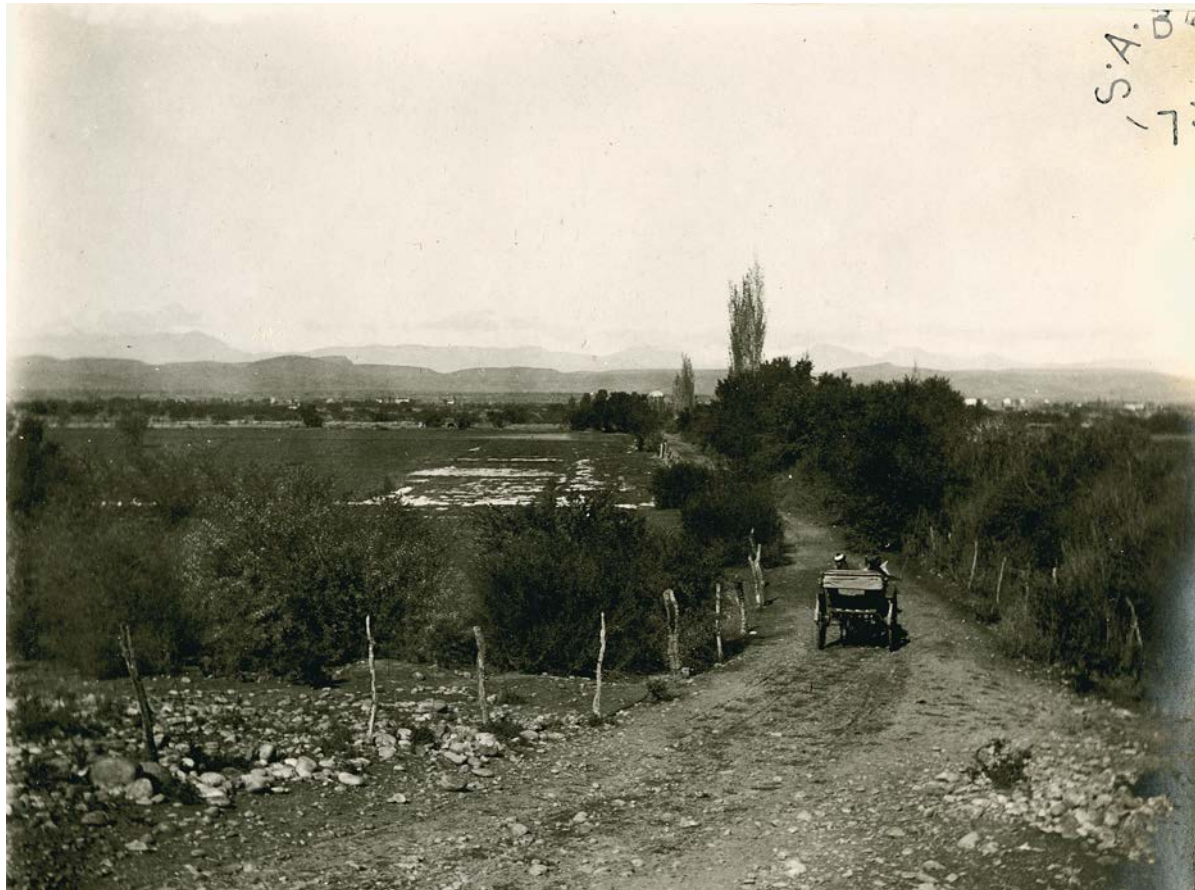
Illustration 3: The ostrich farm, Armoed, in the Oudtshoorn district, circa 1899. Flood irrigation can be seen on the left of the photograph. 29

Dam construction gained impetus from the 1860s as a result of the first discoveries of diamonds at what became known as Kimberley in 1871 and then gold on the Witwatersrand in the early 1880s. New towns, such as Kimberley and Johannesburg – located close to mineral deposits rather than water resources – now required reliable water supply for thousands of newcomers searching for riches and glory, while the demand for foodstuffs found farmers applying innovative ways to improve their yield. 28 One of the ways in which farmers sought to overcome the country's naturally erratic water supply was through the establishment of storage schemes.