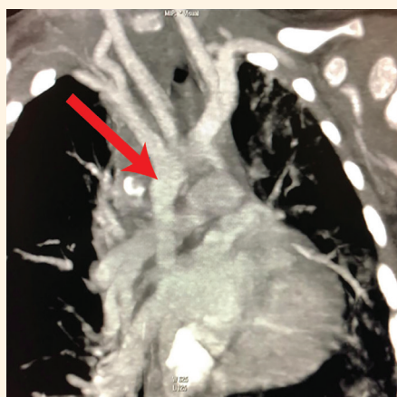
Figure 2: Coronal reformatted computed tomography scan of the lungs of a 16-month-old girl showing right-sided aortic arch (red arrow) with a midline descending aorta.

A computed tomography (CT) scan performed during the sixth hospital admission at 16 months revealed an accessory bronchus arising from the posterolateral aspect of the trachea supplying the entire right side approximately 9 mm proximal to the carina suggestive of a bronchus suis. There was a focal luminal stenosis of the bronchus suis approximately 1 cm from its origin along with marked hyperinflation of the affected right upper lobe [Figure 1].