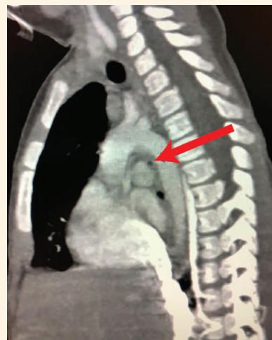
Figure 3: Sagittal reformatted computed tomography scan of the chest of a 16-month-old girl showing compression of the accessory tracheal bronchus (red arrow) between the anomalous right-sided aortic arch and pulmonary artery leading to luminal stenosis and bronchomalacia.

CT angiography revealed a persistent right-sided aortic arch, a midline descending aorta and an incomplete left aortic arch [Figure 2]. The accessory tracheal bronchus was markedly compressed between the abnormally placed right-sided descending aorta and the right pulmonary artery [Figure 3]. The left lung appeared small. The left pulmonary artery was absent with the left lung receiving arterial supply mainly from the bronchial arteries and multiple pleural branches.