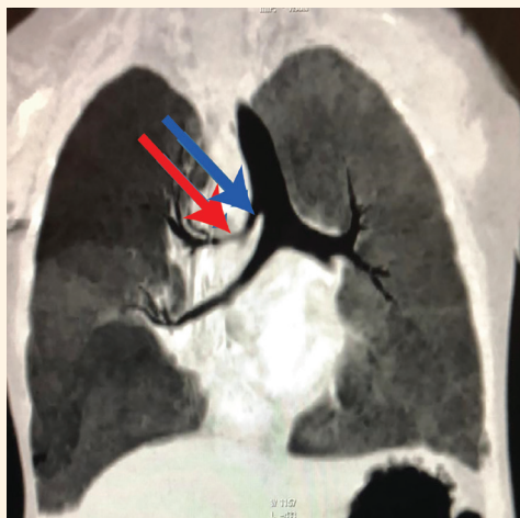
Figure 1: Pre-operative computed tomography scan of the chest of a 16-month-old girl showing the presence of an accessory bronchus (blue arrow) on the right side arising directly from the supracarinal trachea at a distance of 8-9 mm from the carina, suggestive of a tracheal bronchus. Entire right upper lobe is supplied by this accessory bronchus and there is marked focal thinning of the tracheal bronchus approximately 1 cm from its origin (red arrow). There is associated hyperinflation of the upper lobe of the right lung with paucity of the bronchovascular markings.

ventilatory support. Chest X-rays showed right upper lobe consolidation/collapse which was treated as lobar pneumonia.