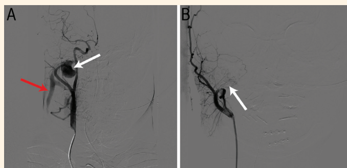
Figure 1: Digital subtraction angiography images of the anterior-posterior view of the right external carotid artery (ECA) of a 32-year-old male patient showing (A) right maxillary artery pseudoaneurysm (MAP; white arrow) with early filling of the right internal jugular vein indicating an arteriovenous fistula (AVF; red arrow) and (B) the ECA after platinum coil embolisation showing the resolution of the MAP and AVF (white arrow).