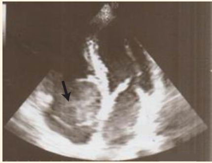
Figure 1: Transthoracic echocardiogram of the heart of a 76-year-old male patient showing a cystic mass in the right atrium (arrow).

no heart murmurs or other abnormal finding such as tachycardia or tachypnoea. Routine laboratory tests and thrombophilia screening were normal.