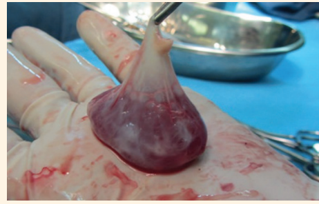
Figure 3: Photograph of the surgically removed blood cyst from the right atrium of a 76-year-old male patient showing gross pathology of a cyst filled with saline.

atrium, a black blood filled cystic mass was found. The cystic mass with its short stalk was connected to the coronary sinus valve [Figure 2]. The stalk of mass was excavated from its base by removal of the sub-endocardial layer [Figure 3]. In addition, the PFO was closed using prolene sutures. The patient was weaned from cardiopulmonary bypass and had an uneventful course. Histological examination revealed a blood cyst with internal cobblestone-like endothelium [Figure 4]. The stone-like nodules were not evaluated by a pathologist.