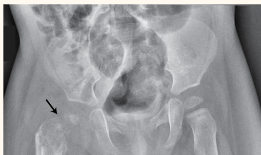
Figure 1: Hip X-ray of an eight-month-old boy showing reduced hip joint space with fragmentation and collapse of the right femoral head (arrow).