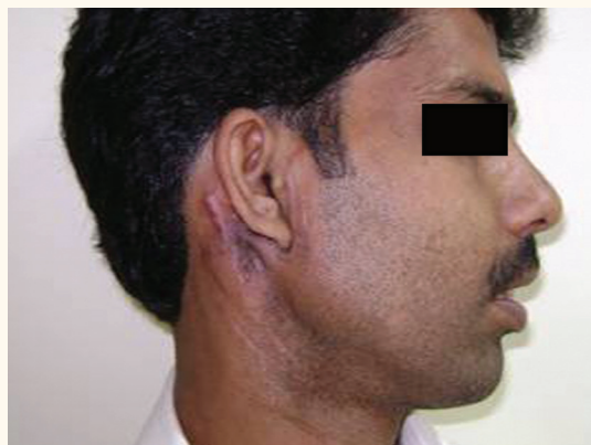
Figure 4: Post-surgical photograph of the patient.

sclerosing sialadenitis. 2,5 The possible pathogenetic mechanisms causing this type of sclerosis are tumour infarction and mucin extravasation. 5 The mucin acts as a foreign material, resulting in fibrosis that forms as an attempt to wall-off the mucin.