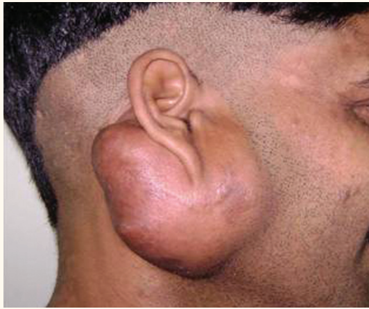
Figure 1: Multilobulated swelling of the right parotid region with slight erythema of the overlying skin.

biopsy included fine needle aspiration cytology (FNAC) and a computed tomography (CT) scan. The FNAC findings were inconclusive due to the paucity of cells. The CT scan revealed a well-defined soft-tissue density lesion [Figure 2]. A provisional diagnosis of a benign salivary gland tumour was considered due to the lack of adenopathy, a lack of nerve dysfunction, the CT findings and the duration of the tumour mass.