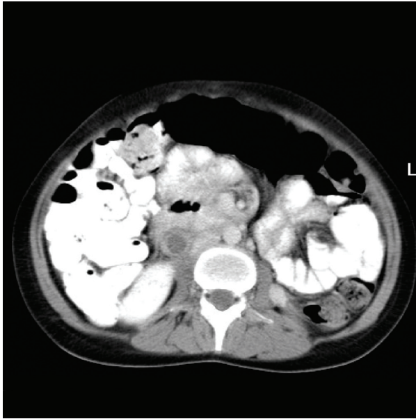
Figure 1: CECT shows a round hypodense lesion to the right of the IVC with marginal enhancement