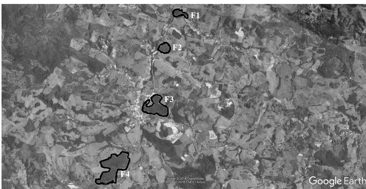
Fig 1. Location of the Montane Semideciduous Seasonal Forest fragments used to evaluate the impact of fragmentation on the social wasps' communities in the south side of the state of Minas Gerais, in the Southeast region of Brazil.

The researched areas are Montane Seasonal Semideciduous Forest, in the domain of the Atlantic Rainforest Biome (Oliveira Filho, 2006). To record the species two methodologies were applied: the active search and the attractive traps. The first was used between 8 a.m. and 5 p.m. in the four seasons of the year, split in five days for each forest fragment in a total of 80 hours of sampling, performed by three researchers. This method was consisted of running across the pre-existent tracks in the border and interior of the forest, and the capturing of the insects was assisted by an entomological web.