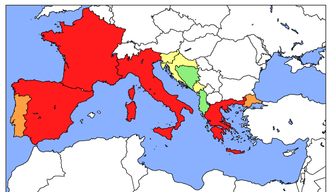
Fig 1. Map of the Mediterranean region. The areas not considered in this study are left blank. Areas hosting no exotic ant species are marked in green, areas hosting a single exotic ant species are marked in yellow, areas hosting 4-7 exotic ant species are marked in orange, the remaining countries, hosting 14-21 exotic ant species, are marked in red.