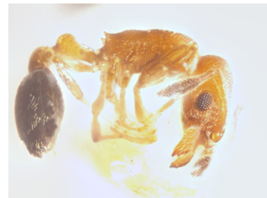
Figures 8-10. Cardiocondyla wroughtonii (Forel, 1890) (8) Head, frontal view; Habitus (9) dorsal view; (10) lateral view.

Material examined: Pakistan, Islamabad, Trail 5 Forest area, 33°45.247'N 73°05.146'E, 631 m. a.s.l., 5 (workers), 20.ii.2015, leaf litter, 5 (workers), 05.iv.2017, soil nest, 11 (workers), 14.x.2017, leaf litter, leg. M.T. Rasheed; Rawalpindi, Forest area Murree 33°51.008'N 73°19.162'E, 1158 m a.s.l., 4 (workers), 20.iv.2015, flowering plants, leg. I. Bodlah; Rawalpindi, Forest area Kotli Sattian, 33°41.902'N 73°30.612'E, 1261 m a.s.l., 9 (workers), 05.xi.2016, leaf litter, leg. I. Bodlah; Rawalpindi, Forest area Osia, 33°43.255'N 73°02.150'E, 1482 m a.s.l., 6 (workers), 19.x.2016, leaf litter, leg. M.T. Rasheed; Islamabad, Forest area Pir Sohawa, 33°78.82'N 73°10.69'E, 1482 m a.s.l., 12 (workers), 23.viii.2016, nursery plants, leg. I. Bodlah; Rawalpindi, Forest area Neela Sand, 33°95.16'N 73°22.007'E, 923 m a.s.l., 10 (workers), 04.vi.2017, soil nest, leg. A. G. Fareen; Rawalpindi, Forest area Neela Sand, 33°51.008'N 73°19.162'E, 1482 m a.s.l., 10 (workers), 25.ix.2017, soil nest, leg. A. G. Fareen; Islamabad, Kachnar Park Forest area, 33°40.602'N 73°04.574'E, 603 m. a.s.l., 1 (worker), 31.viii.2017, tree bark, leg. M.T. Rasheed. Distribution: Pakistan (new record).