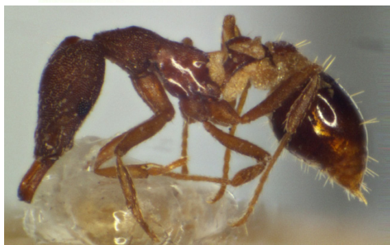
Figures 5-7. Strumigenys godeffroyi Mayr, 1866 (5) Head, frontal view; Habitus (6) dorsal view; (7) lateral view.