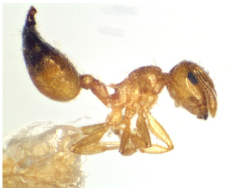
Figures 11-13. Crematogaster biroi Mayr, 1897 (11) Head, frontal view; Habitus (12) dorsal view; (13) lateral view.

297); Astore, Bunji, Gilgit-Baltistan (Eidmann, 1942: 246).