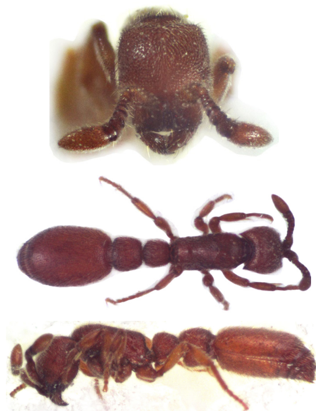
Figures 2-4. Ooceraea biroi (Forel, 1907): (2) Head, frontal view; Habitus (3) dorsal view; (4) lateral view.

Cerapachys (Syscia) biroi Forel, 1907: 7. TL: Singapore [Lectotype: MHNG].