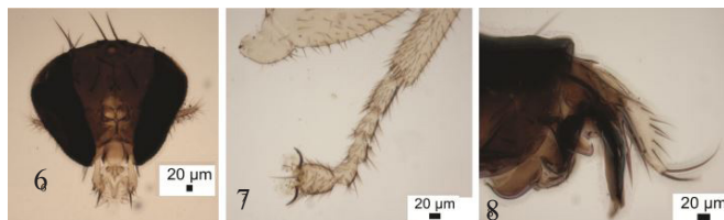
Figs 6-8. Problem damaged specimen, male. 6, frontal view of head; 7, front tarsus; 8, left face of hypopygium.