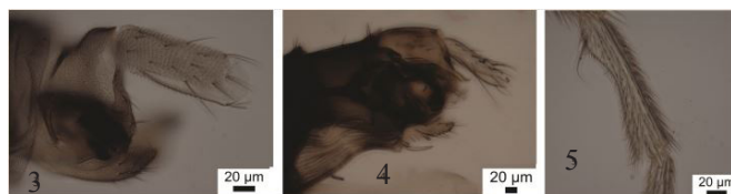
Figs 3-5. Puliciphora males. 3, species A, left face of hypopygium; 4-5, species B; 4, left face of hypopygium; 5, front basitarsus.