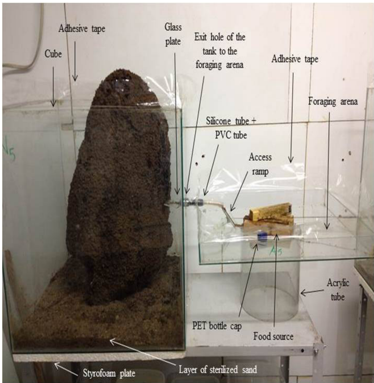
Fig 1. Cube, for the colonies of Nasutitermes corniger , connected to the foraging arena.

The tests were conducted in the foraging arenas based on the methodology described by Gazal et al. (2010). Thirty minutes before the start of each test, the connection between the nest and arena was blocked with hydrophilic cotton to impede the termites from accessing the arena. Then, the food was removed from the arena and replaced with the treatments (eucalyptus blocks that were 5, 10 and 15 cm long) on glass plates (5.0 x 4.0 cm, 10.0 x 4.0 cm and 15.0 x 4.0 cm, respectively). The treatments were placed in a situation of choice and equidistant from the termite access point to the arena; that is, the blocks were inside the arena, 19 cm from the base of the access ramp. For each test, the position of the treatments in the arena was randomized.