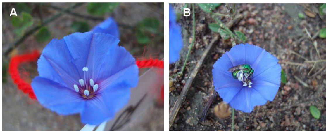
Fig 2. (A) Flower of Jacquemontia evolvuloides (Convolvulaceae). Detail of the reproductive structures. (B) Detail of a floral visitor bee ( Augochlora sp., Halictidae).

The anthesis of J. evolvuloides flowers occurs in the morning. Pollen is available to flower visitors from the moment of opening, and the stigma is receptive immediately and remains so until senescence; the flowers last approximately five to six hours. The first flowers of J. evolvuloides open near 05:30 h, with full opening generally occurring between 06:40 and 07:00 h, with a longer delay during the winter months due to lower temperatures and later sunrises. The flowers close between 11:47 and 14:09 h (Table 1). The flowers opened and closed later in June and July when temperatures were lower and the photoperiod shorter (later sunrises).