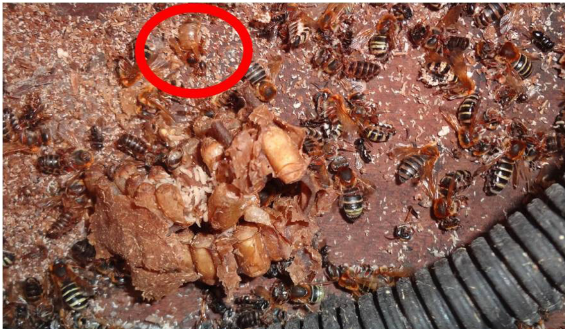
Fig 3. Large number of specimens of Melipona quinquefasciata Lepelletier, 1836 killed on the ground of hive, after the first attack observed. In detail physogastric queen.