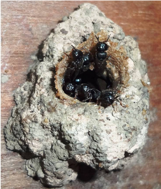
Fig 2. Small wax tube constructed by Lestrimelitta rufa (Friese, 1903) at the entrance orifice of a nest of Melipona quinquefasciata Lepeletier, 1836.

After the invasive workers entered the colony, a guard bee of M. quinquefasciata was seen ventilating in the entrance orifice. The attack continued inside the hive and individuals of both species were in direct confrontation. A single individual of M. quinquefasciata was attacked by three to four individuals of L. rufa . The inquiline workers were apparently disoriented,