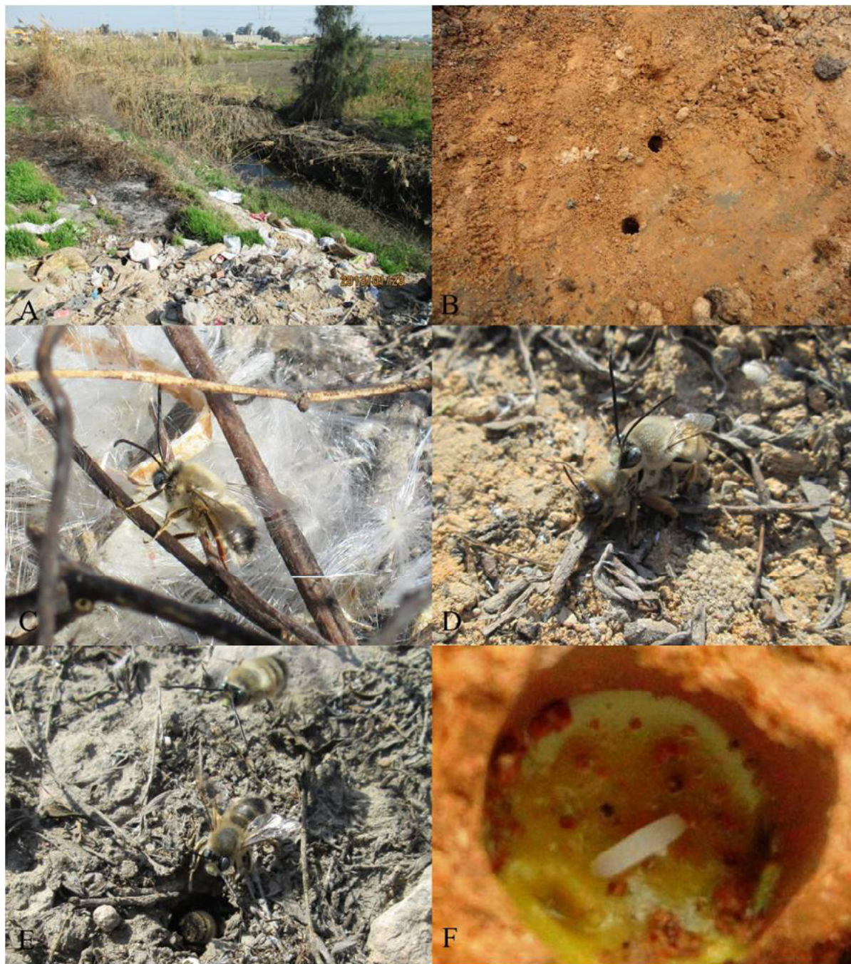
Fig 2. A. Nesting site area; B. Nest entrance; C. Mature male of the resting site; D. Mating, E. Nesting activities, F. The eggs.

The sand, silt and clay were 70.6, 22.3 and 8%, respectively. The EC, SAR, and \text{CaCO}_3 were 1.5 \text{ dSm}^{-1} , 2.52, and 3.14 %, respectively. The soluble \text{Ca}^{2+} , \text{Mg}^{2+} , \text{Na}^+ and \text{K}^+ were 4.9, 3.1, 5.0 and 2.0 \text{ meq l}^{-1} , while soluble \text{HCO}_3^- , \text{Cl}^- and \text{SO}_4^{2-} were 3.5, 7.7 and 3.8 \text{ meq l}^{-1} , respectively (Table 1). During another field survey of bees in Canal Region (Shebl et al., 2013) E. nigrilabris were not collected from that area. The type of the soil at that area was sand mainly desertic areas. Our assumption that the bees composition could be affected not only by their floral resources but also by their nesting resources suitability (Pots et al., 2005; Cane et al., 2007). So some species could have a limited distribution due to their nesting resources and the soil characteristics of that