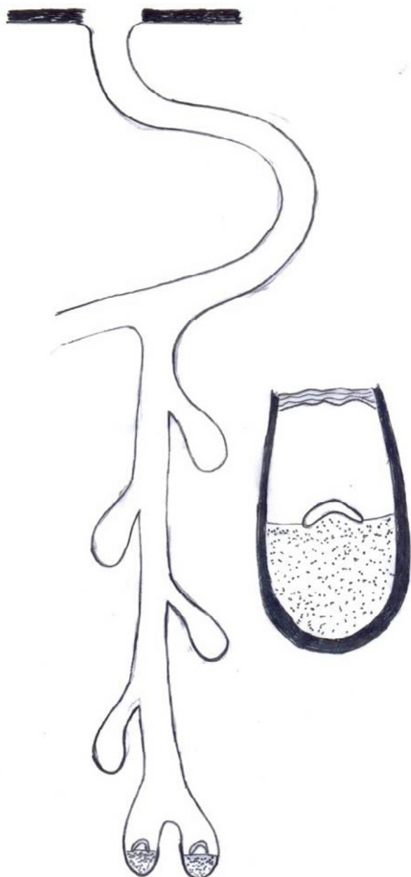
Fig 1. Nest Architecture of Eucera nigrilabris Lepeletier, 1841.