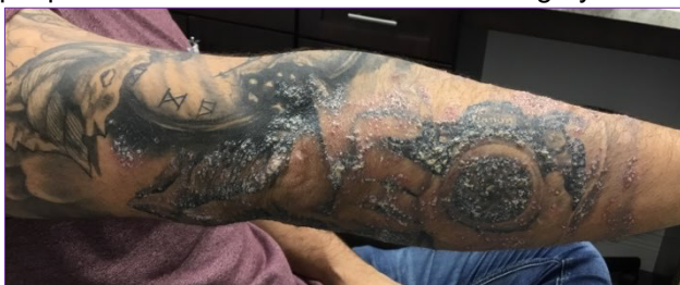
Figure 1. Hyperkeratotic papules coalescing into plaques distributed in areas tattooed with grey ink.

Histologic examination demonstrated a focal area of papillary dermal granulomatous and suppurative inflammation with associated superficial and deep perivascular lymphocytic infiltrate (Figure 2). AFB and Fite stains highlighted small collections of acid-fast bacilli within the granulomatous inflammation (Figure 3). PAS stain was negative for fungi and Treponema pallidum immunoperoxidase analysis was negative for spirochetes. Along with the clinical examination, the histologic findings supported a diagnosis of atypical mycobacterial infection in association with grey tattoo ink. Additional biopsies for tissue cultures and PCR were performed, and the patient began doxycycline, moxifloxacin, and clarithromycin. The subsequent culture and PCR testing were negative.