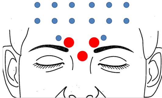
Figure 1: Standardized injection pattern for both study arms.

Oncology, vol. 18, no. 1, 1992, pp. 17-21., doi:10.1111/j.1524-4725.1992.tb03295.x