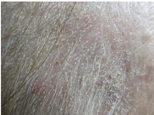
Figure 1. Follicular keratotic papules and associated hair loss on scalp of 62 year-old female.

A 62 year-old woman presented with hair loss on her scalp, face, neck, and arms for 2 years. The hair loss was associated with an initial red rash that persisted for several months, and then cleared. The hair loss persisted with dryness, flaking, and itching. There were no known aggravating or alleviating factors and no previous medical problems. The patient was taking no medications or supplements. Thyroid stimulating hormone (TSH) and antinuclear antibody (ANA) screen were negative. A physical examination revealed follicular keratotic papules and associated hair loss distributed throughout the scalp, post-auricular area, and posterior neck (Figure 1).