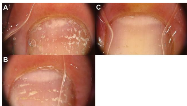
Figure 1. Case 1 A) Before treatment B) Progressive improvement after five C) and ten months of treatment

A 42-year-old male presented with adult-onset, mild changes in nail appearance and texture. Physical exam showed pitting in the left small fingernail, right thumbnail, and right index fingernail plates. A diagnosis of psoriasis of the nail was established, and global/microscopic pictures (executed with FotoFinder medicam dermoscopy) were obtained to document the nail changes at baseline (Fig 1, A). The patient was subsequently prescribed daily Cal/BD aerosol foam. On five- and ten-month follow-up exams, dermoscopy demonstrated a decrease in nail pits and an improvement of nail plate surface abnormalities (Fig 1, B, C).