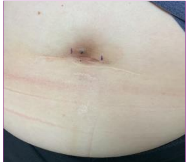
Figure 1. Solitary 1.5-cm bluish nodule at the umbilicus

CEM presents a diagnostic challenge as lesions are commonly mistaken for keloid, dermatofibroma, dermatofibrosarcoma protuberans, melanoma or cutaneous metastasis of cancer (e.g., Sister Mary Joseph nodule). 1-5 As studies have shown that 14% of women with CEM in gynecological scars have associated pelvic