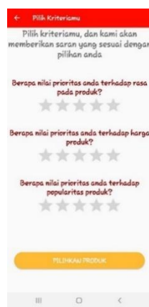
Figure 4. criteria selection form