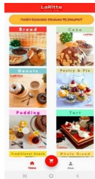
Figure 2. menu display user based on Android App

Applications that are used by Android-based customers are designed for registration, application login, selecting products, transactions, checking orders, and rating orders that have been made