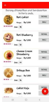
Figure 3. Result of SMART method