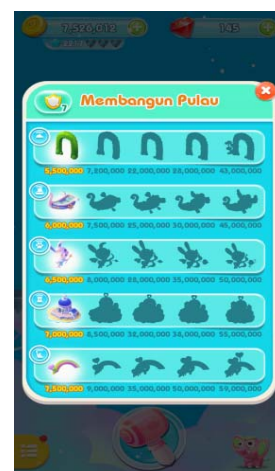
Figure 4. in-game display to build the island

The main goal of this game is to build all the buildings on one island. Every week there will be a new island. A player who wants to build a building must be having chips from spinning wheels. Besides building, players have to guard their building against another player using "perisai" or shield that can be got from spinning wheels too. Players can steal another player's chips. Every building has the different price of chips according to level, so players have to gather chips as much as they can.