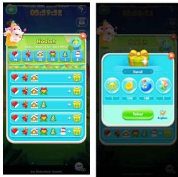
Figure 5. Puzzle and tree game display to get points