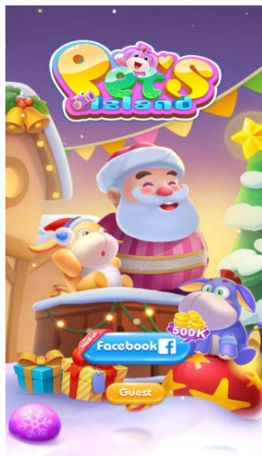
Figure 3. Connect to Facebook can play with other friends

Player has to login with a Facebook account, and automatically all of the player's friend on Facebook will become player's friend on the game and connected to others.