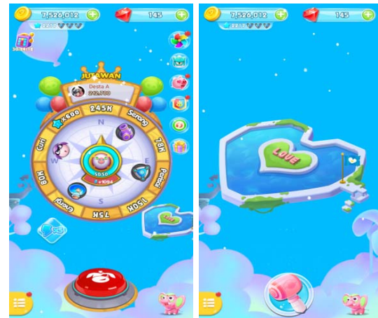
Figure 2. Game view to get points and share with other friends