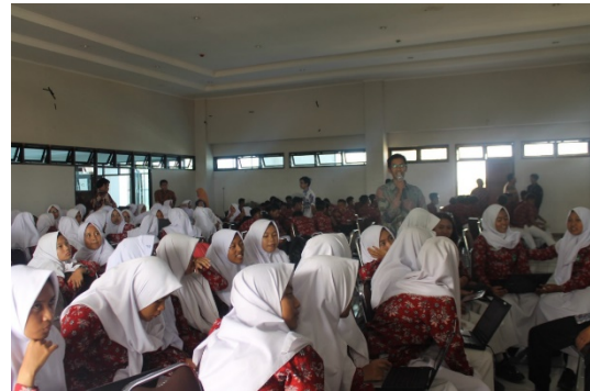
Figure 2. Submission of CMS-WordPress training.