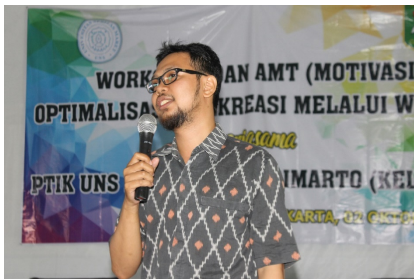
Figure 1. Lecture on the benefits of information and communication technology