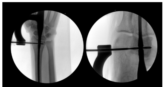
Figure 2. Jig locking in radius and ulna

The time for each locking attempt was recorded. A preliminary image intensifier scout view was taken, and an incision was made over the locking holes. The drill was placed onto the bone, and another image intensifier view was taken to ascertain the drill tip's position. The timer for locking was then started, and all exposures,