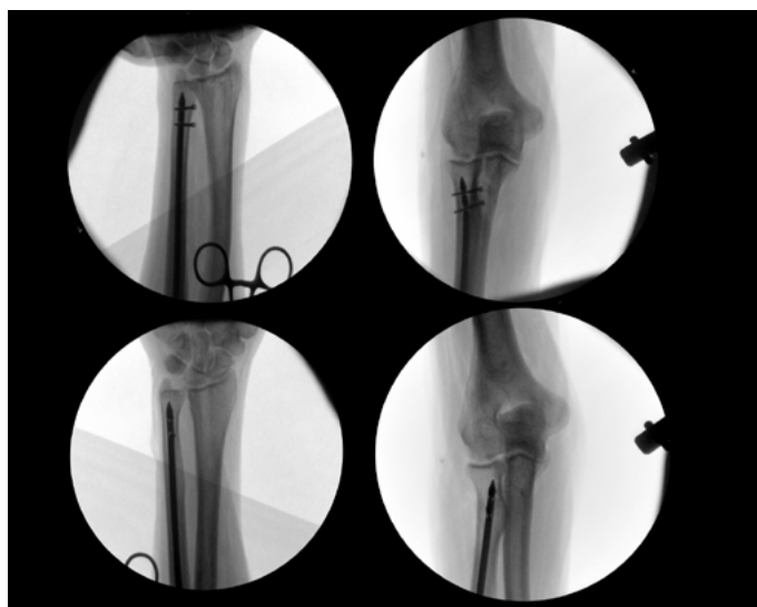
Figure 4. Locking screws placed at the non-driving end of the ulna and radius shown in an AP and lateral plane. Screws are placed from volar in full supination for the radius and from dorsal in a fully pronated ulna.

including the second scout view, were recorded. The timer was only stopped once the drill was passed through the opposite cortex and confirmed with fluoroscopy (Figure 3). The number of locking attempts was recorded, and the timer continued until the locking was successfully accomplished. Screws were passed through the nail for confirmation of locking (Figure 4). The number of exposures and total screening time of each attempt was recorded in minutes. All nails were removed after insertion, with the ability to remove the nail being recorded.