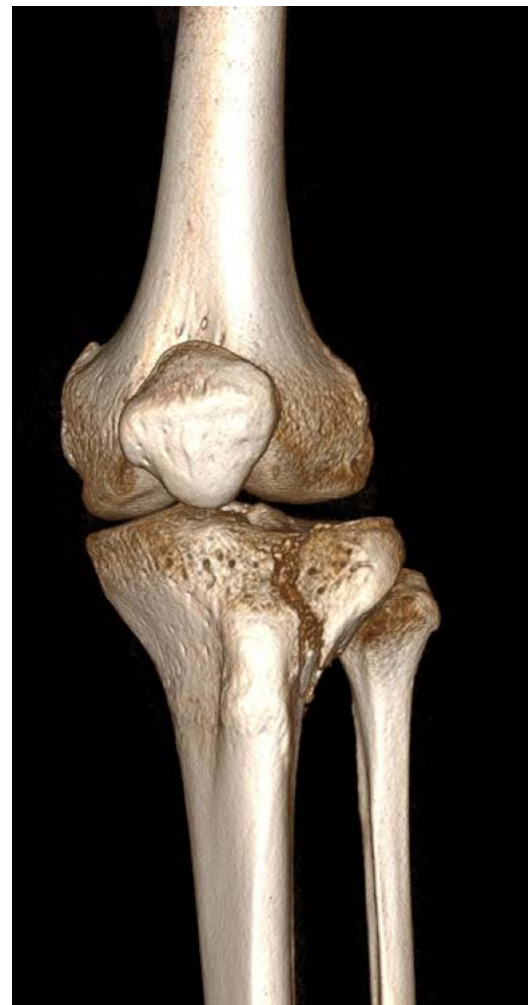
Figure 1. A screenshot of a digital 3D CT scan used

The CT data was processed digitally (Phillips IntelliSpace Portal system, Phillips, Netherlands) to produce 3D images to be assessed on a computer screen ( Figure 1 ) and which could be rotated in all planes at the observer's discretion. Patient identifiers were replaced with research numbers. The volumetric data from the CT scans was converted to Standard Tessellation Language files used to print corresponding 3D models at a 1:1 scale by additive printing (Ultimaker II 3D printer, Ultimaker BV, Netherlands). The models used (both 3D CT and 3D-printed models) consisted of a distal femur and proximal tibia. The patella was removed as it has no bearing on classification. Polylactic acid was used as the medium because it is a rigid, bio-friendly plastic and is manufactured in a matt white colour resembling cortical bone ( Figure 2 ). All models were printed using a 20 µm definition setting in the same printer using the same batch of material. The cost of 3D model