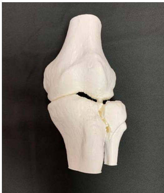
Figure 2. A picture of a 3D printed model used

manufacturing at the time of publication was estimated at R1 500 per model. Manufacturing time was estimated at roughly 24 hours, depending on the model size and complexity.