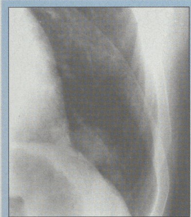
Figure 3: Frontal chest radiograph one year later reveals 1.5 cm medial shift of coin lesion as compared to more lateral position previously. This is postulated to be due to traction fibrosis/pleural injury following previous biopsy traversing the major fissure.

lobectomy was performed, and the patient made a satisfactory recovery.