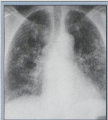
Figure 2a: Chest radiograph of a 63-year old woman with hut lung. Nodules are of variable size and less profuse in the apices. Vascular clarity is lost.

scarring. The varying density and size of the nodules is uniform and indistinguishable from the appearances of miliary tuberculosis or of nodular sarcoidosis (Figures 1b and 2b). However, the beaded pattern along bronchovascular markings which is characteristic of sarcoidosis has not been observed. We have concluded however that the CT appearances of hut lung are indistinguishable from these other two conditions, and for this reason HRCT is not viewed as an essential investigation in such cases.