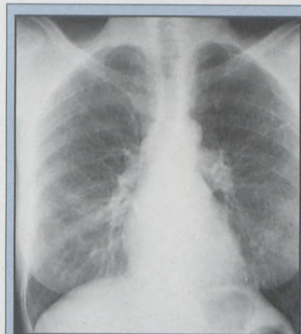
Figure 1a: Chest radiograph of a 59-year old woman with hut lung showing the diffuse fine nodular interstitial pattern with loss of vascular clarity.

Chest radiographic changes range from diffuse fine rounded regular nodules resembling miliary tuberculosis to extensive fibrosis resembling progressive massive fibrosis (Figures 1a and 2a). The majority have nodules of varying size and density. The profusion scores (ILO-UICC scoring system for pneumoconiosis) range from 1/1-3/3 changes. All zones of the lung are usually involved although not uniformly, but progressive massive fibrosis usually affects upper lobes and is surrounded by characteristic traction bullae.