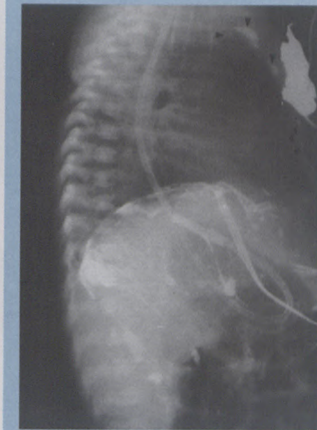
Figure 2: Post-operative lateral chest radiograph confirms the retrosternal position of the barium (arrowheads) in keeping with its drainage via the internal thoracic lymphatic chain.

barium tracking along the retrosternal part of the chest and at the thoracic duct. This represented barium entry into the internal thoracic chain of lymph nodes. At the time of this report the patient's condition was stable.