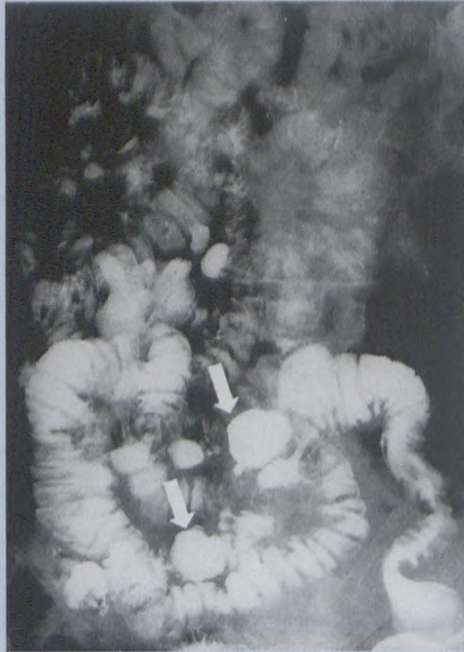
Fig. 1 a. Barium study of the small bowel showing multiple diverticulae predominantly in the jejunum; arrows point to two of the larger ones.