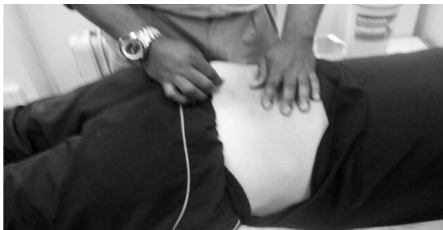
Figure 1: Clinician administering acupuncture treatment on patient lower back area

The exclusion criteria were major trauma or systemic diseases, generalised dermatopathologies, pregnancy, inability or unwill-