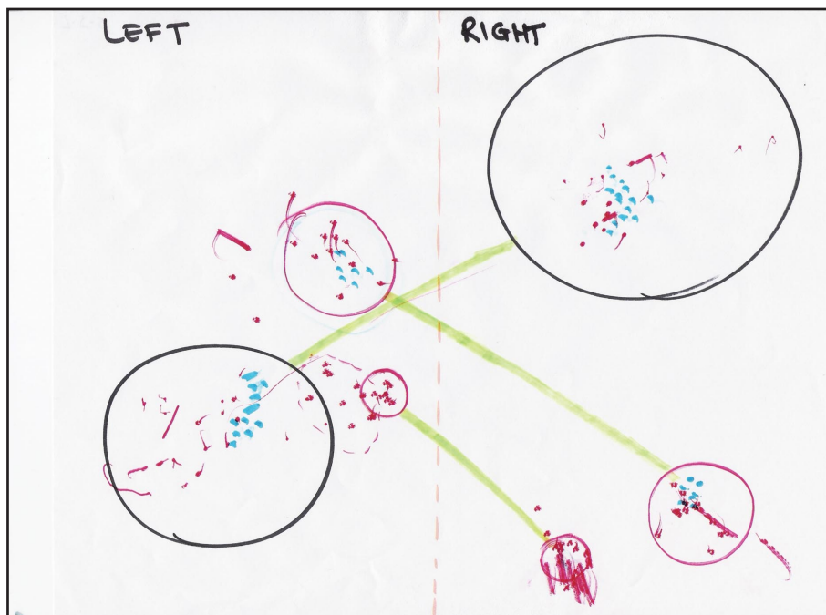
Figure 1. The patient's proprioceptive progression from large to small circles.

Clinical decision-making is guided by the patient's clinical presentation, the stage of the injury, goals and the provider's formal knowledge and experience. Following a rear-impact collision of only 5x gravitational force (gs), a significant increase in the inter-vertebral neutral zone and range of motion occurs, leaving the lower cervical spine, specifically C5/6 most at risk for injury. During an acceleration of 3.5gs and above, facet joint components such as the synovial fold, articular cartilage and capsular ligaments are at risk of injury, due to facet joint compression and excessive capsular ligament strain during impact. Facet joint compression that exceeds physiologic limits could injure articular cartilage when the upper facet collides with the lower facet. When the collision force is enough, irreversible damage to the cartilage matrix and chondrocytes occur. Mechanoreceptors in the facet capsule and synovial fold can be damaged during whiplash causing