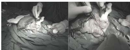
Figure 2 - A surgical exposure of lumbosacral lipoma, B lateral dissection of the lipoma

After total resection of the lipoma and detaching of the placode from the inner dura we rule the placode on itself by suture to decrease adhesion between it and inner dura by making the contact surfaces smooth. The closure was by interrupted 6-0 nylon sutures without force.