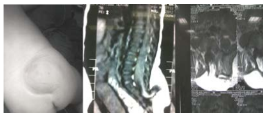
Figure 1 - Lipomyelomeningocele A, B MRI 1 tista sagittal and axial cuts T1 W show lipoma, cerebrospinal fluid surround part of the conus protrude out of the spinal canal through a dorsal defect

In the literature the lipomyelo – meningocele defined as a part of the distal conus and the fat protrudes outside through the dorsal bony defect, with sac filled by cerebrospinal fluid (CSF). (1, 15)