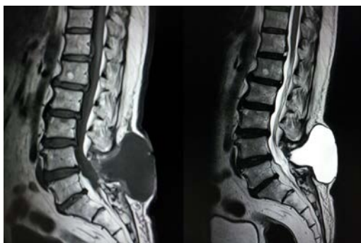
Figure 2 - T1W sagittal image showing a hypointense lesion and T2W sagittal image showing a hyperintense cystic lesion located posteriorly at L4-5 level