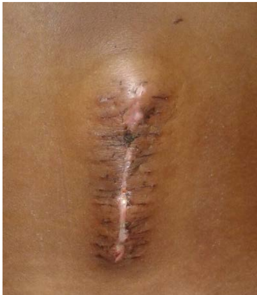
Figure 1 - Fluctuating swelling at operative site