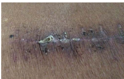
Figure 5 - Postoperative image after removal of sutures