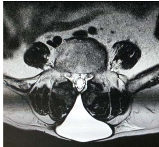
Figure 3 - T2W axial image of the cystic lesion

Based on clinical and radiological findings, diagnosis of pseudomeningocele was made. In view of symptoms patient was taken up for surgery.