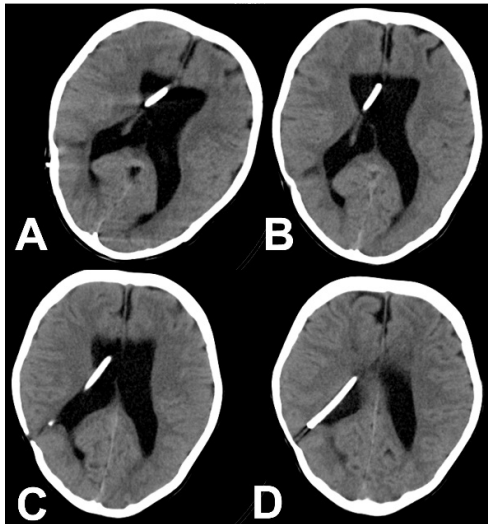
Figure 2 - Repeat plain CT of the brain (A-D) showing no significant reduction in the hydrocephalus, however notice the asymmetry or upper portion the right lateral ventricle due to preferential drainage