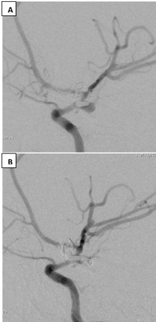
Figure 3 - DSA - A showing the aneurysm neck clip reconstruction and remnant aneurysm; B - showing the complete coil occlusion of the aneurysm

Coil embolization was performed under general anesthesia five days later after clipping. Using Seldinger technique, 6F arterial sheaths were placed in the right femoral arteries. A 6F guiding catheter was placed in the internal carotid artery or dominant vertebral artery