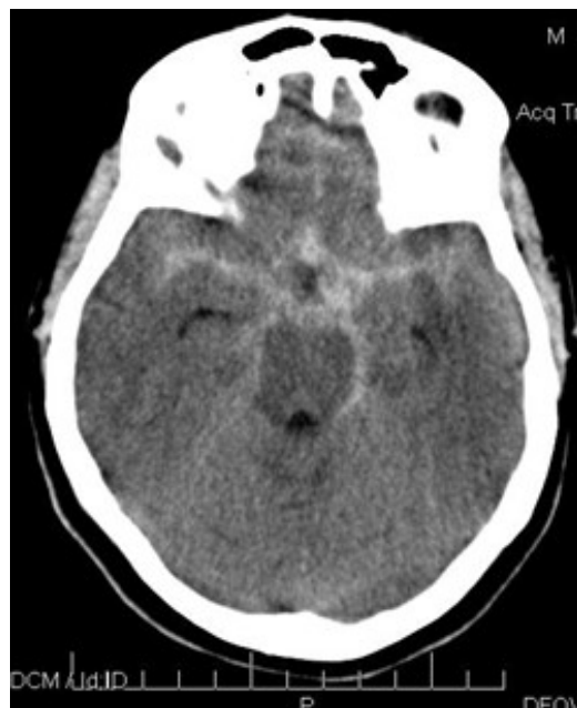
Figure 1 - Brain CT scan showing a subarachnoid hemorrhage

The complex anatomical configuration of the ruptured PcomA aneurysm due to large aneurysmal neck with extension under anterior clinoid process and presence at the neck level of some perforating arteries led to the adoption of a strategy of neck reconstruction by partial clipping followed by coil endovascular occlusion.