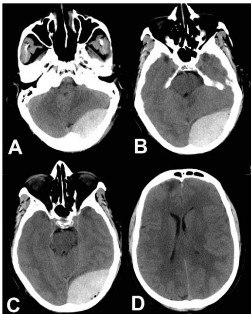
Figure 1 - Pre-operative CT scan brain plain showing a large posterior fossa extradural hematoma with mass effect and small speck of right frontal contusion (please note the small size and distortion of the fourth ventricle)

A 45 year female presented 8 after the road traffic accident. She was in altered sensorium since the time of injury. She had multiple episodes of vomiting. There was no history of ENT bleed or seizures. Her general and systemic examination was unremarkable. She was in altered sensorium (GCS-E2, V2, and M5). Pupils were bilateral equal and reacting to light. She was moving all four limbs equally. Computed tomography (CT) scan brain plain showed a large posterior extradural hematoma on left side with mass effect and distortion of the 4th ventricle (Figure 1).