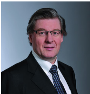
Figure 4 Prof. Helmut Bertalanffy