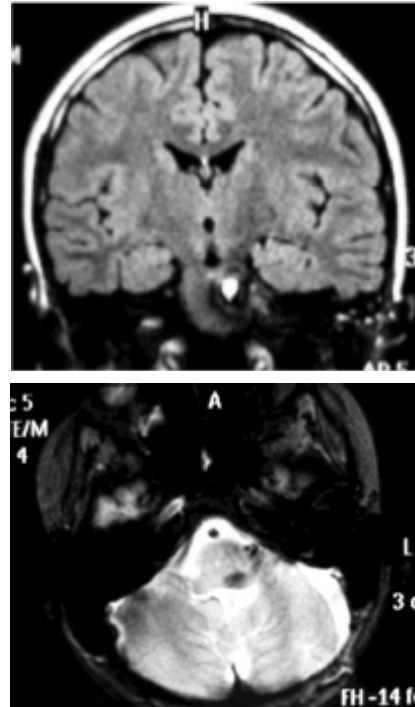
Figure 2 3 weeks postoperative MRI showing residual cavernoma in the left pons

At 3 weeks follow up, nearly complete remission of the right hemi paresis and partial remission of the VI, VII, VIII, IX and X left cranial nerves deficit were observed and the Karnovsky score increased to 60.