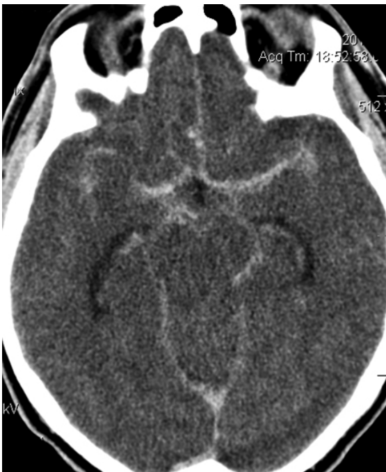
Figure 2 Axial CT scan of the brain showing subarachnoid hemorrhage

Surgical decision making, timing of surgery, prevention of re-bleed, use of endovascular techniques along with grade of the patient, presence or absence of intraparenchymal or intraventricular bleed, with or without vasospasm, affect the outcome.