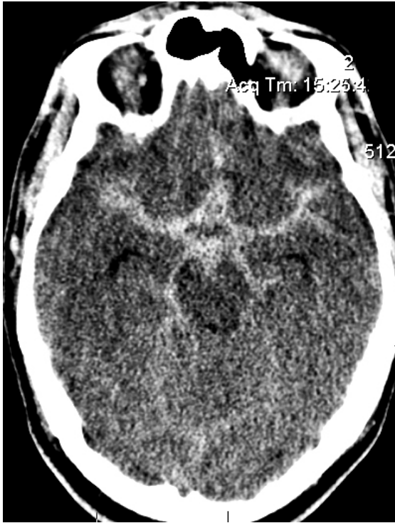
Figure 1 CT scan of the brain showing subarachnoid hemorrhage