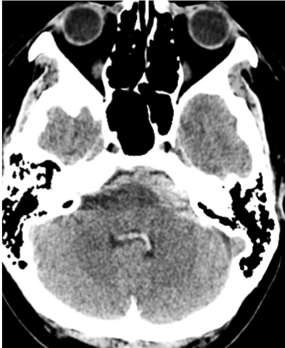
Figure 3 Axial CT scan: subarachnoid hemorrhage of posterior cranial fossa and in the fourth ventricle