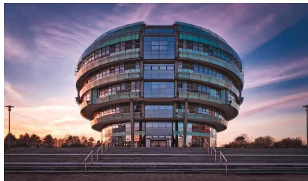
Figure 3. International Neuroscience Institute of Hanover (Open in 2000)

Shaped as a "futuristic" human brain, the International Neuroscience Institute of Hanover (Figure 3) is a unique architectural landmark, enhancing the suggestion that any pathology of the nervous system can be cured.